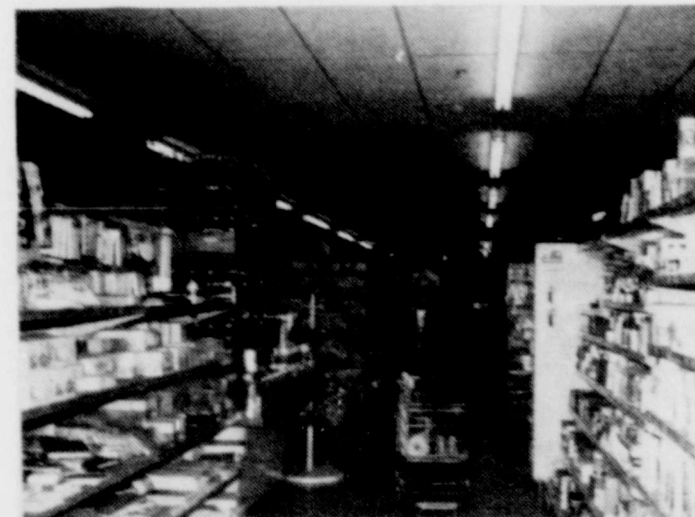
MORE BRANDS are stocked at Sav-A-Lot, making it a convenient one-stop shopping store. Mrs. Arrie Oswald looks for new items.