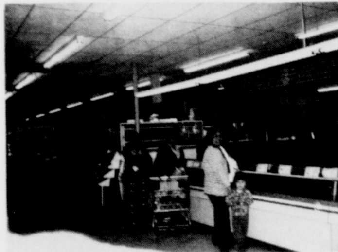
TAKE YOUR TIME! In the roomy area around the meat counter, these ladies can take their time choosing meat cuts without obstructing shopping or traffic.