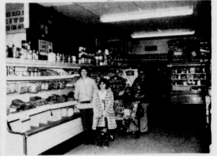
A NICE PLACE TO SHOP - These customers enjoy shopping in the convenient attractive area by the pre-packaged meats.