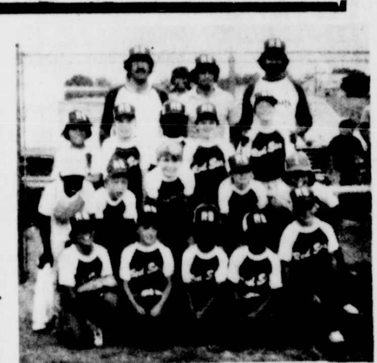
Abernathy Red Sox Team

The 70th Annual Field Day of the Texas Agricultural Experiment Station at Lubbock and Halfway will be held Tuesday, Sept. 11. The Research Center at Lubbock (southeast of New Deal) will be host this year.