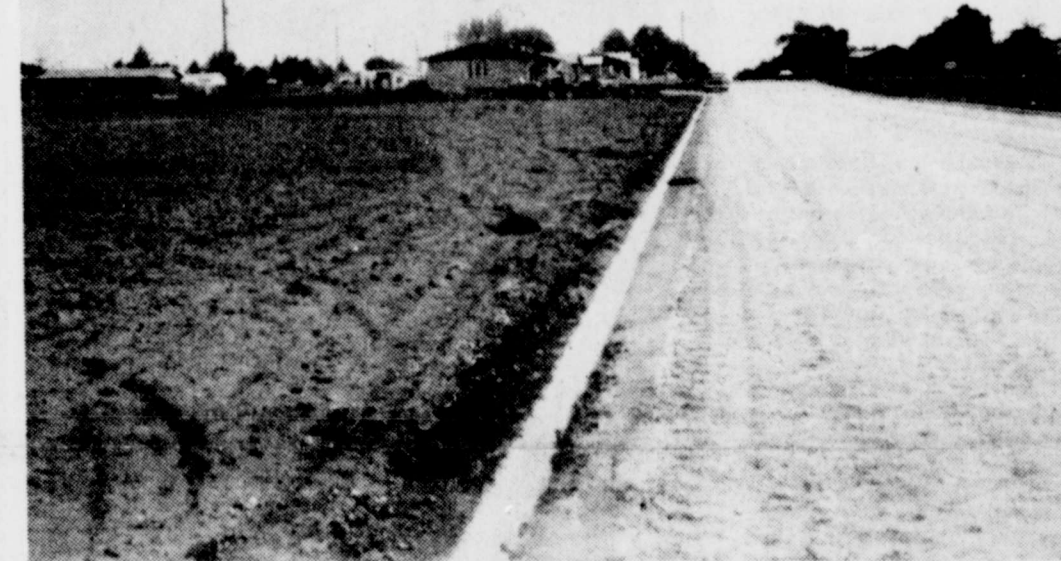
In the above photo is Ave. J looking north to 12th St. These streets are now in process of being paved.