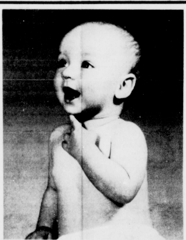
"Yeah!!! Guess I Checked Out Too Much Too Soon."

We are ready to help you with all your banking needs.... come in to see us about your business, loans, checking accounts, savings accounts, or safety deposit boxes. We offer many services to our customers.