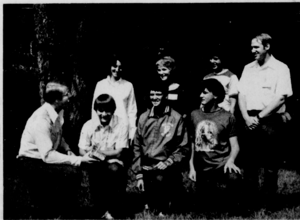
Hale County 4-Hrs and leaders are enjoying the high country this week while attending the 4-H Electric Camp, sponsored by Southwestern Public Service Company, located in the