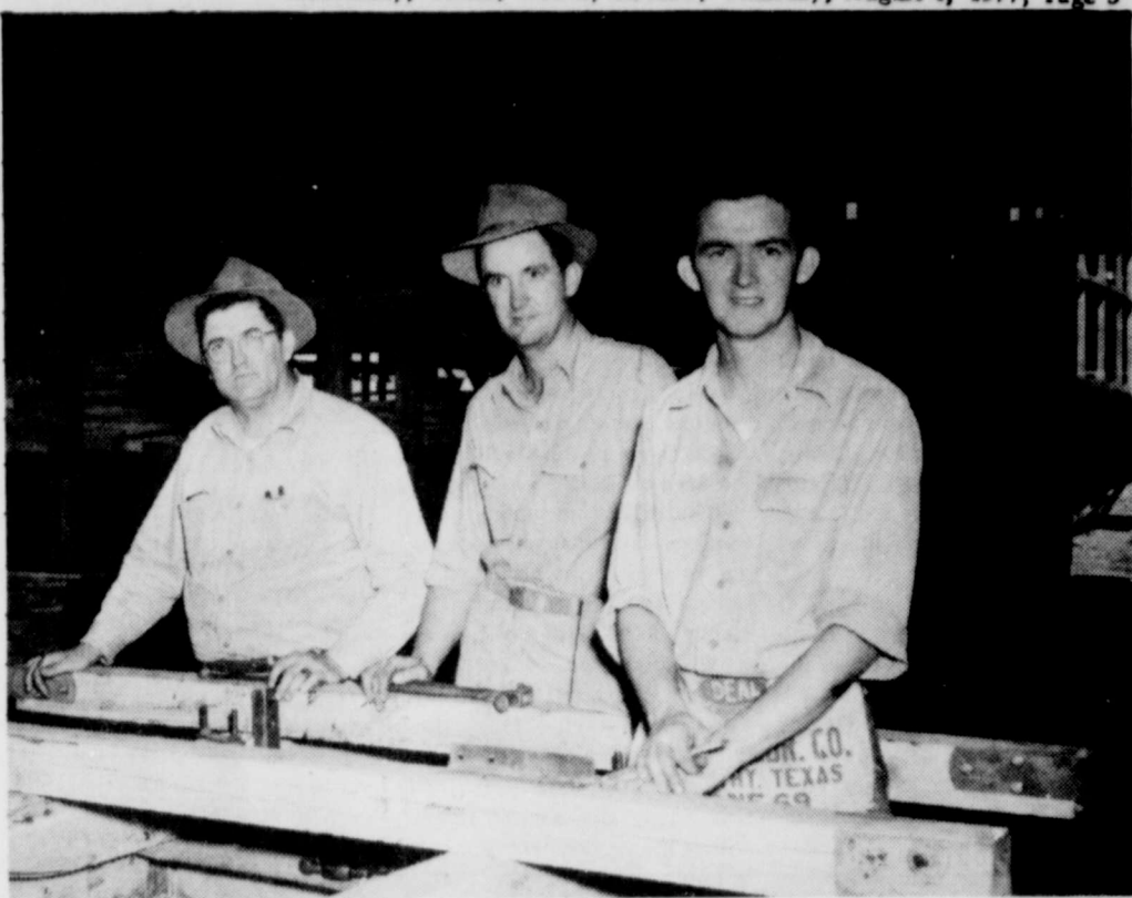
FROM THE REVIEW'S Long-Time-Ago files, showing Father & Sons in their lumber yard operation days in Abernathy.

"If ye have faith as a grain of mustard seed, ye shall say unto this mountain, Remove hence to yonder place; and nothing shall be impossible unto you." Matthew 17:20