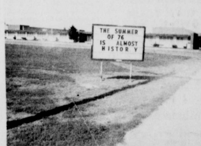
SIGN ON SCHOOL CAMPUS AND THAT'S A FACT-- The Abernathy Classroom Teachers' bulletin board sign at the corner of Ave. E & 8th St. tells the sad story for students and teachers. The