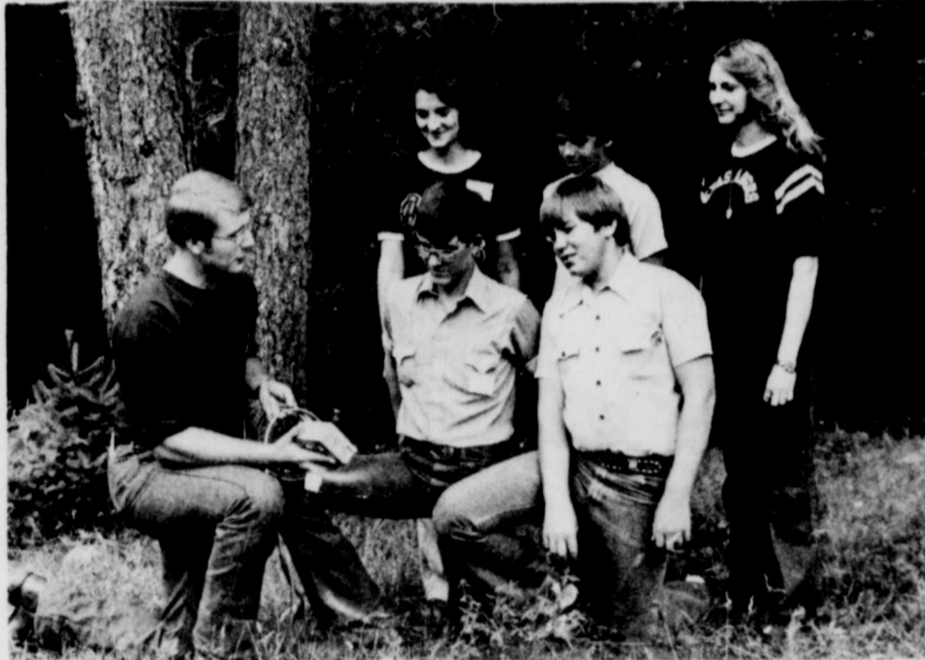
High above the plains of Texas, in the cool of the Sacramento mountains of New Mexico, a delegation of 4-H's from Hale County are attending the 4-H Electric