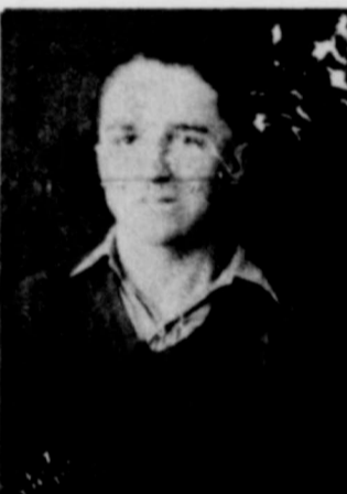
This local ex-student urges all local ex-student, parents, teachers, grandparents, 1976 graduates and all to attend the July 3 reunion and activities.