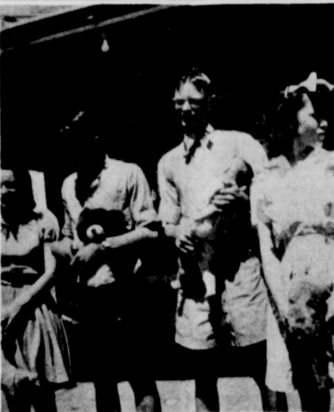
These ex-students seem to be enjoy "kid day" in downtown Abernathy. 19??

Thursday, July 1st has been set for the next regular meeting of the board.