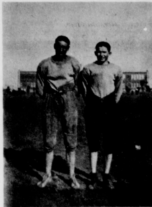
These are two of the 1927 football heroes of Abemathy High School

In my distress I cried to the Lord, and He answered me. (Ps. 120:1)