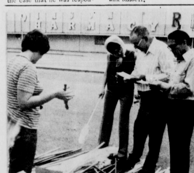
A CLEAN SWEEP -- Is what members of Abernathy Lions Club offered last Thursday during their annual broom sale for the blind. Shown here are a group of customers and Lions as they look over the many items offered at the sale.