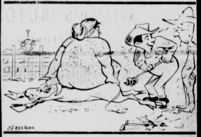
A NEW SQUEEZE COSTS MOR'N $300.00. ANYHOW ... SHE LOVES T'HELD ME BRAND.

FRONT END ALIGNMENT CAN SAVE YOU MONEY, TOO, AT CONSUMERS. WE HAVE THE EQUIPMENT AND KNOW-HOW TO DO THE JOB RIGHT.