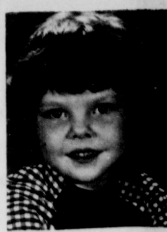
KARA, 5 YEARS