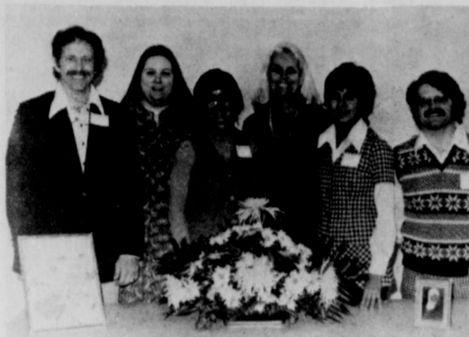
District Convention of the Baha'is of North Texas was held Sunday, October 13, 1974 at West Texas State University's Activity Center, with representatives from Canyon, Amarillo, Lubbock, Hereford, Abernathy, Plainview, Pampa, and Buffalo Springs voting.