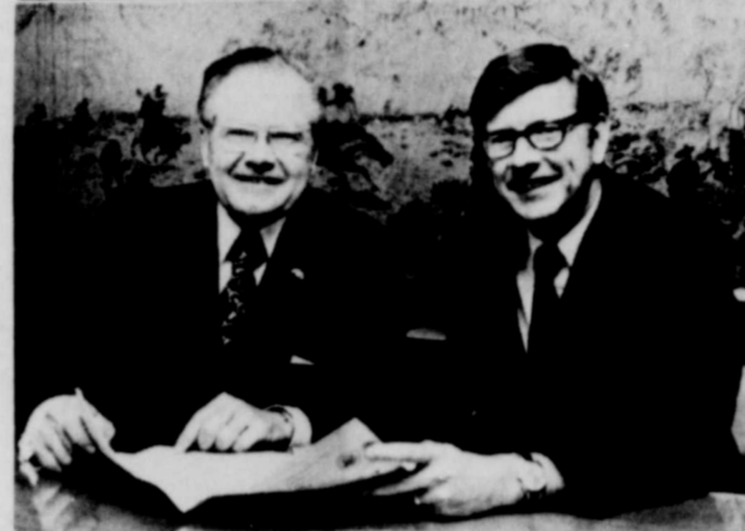
Governor Dolph Briscoe and Ray Farabee, Democratic nominee for the Texas Senate, take time out to look over the platform of the Texas Democratic Party. They discussed the importance of rural development and expansion of water resources as they campaigned together in the 30th district recently.

New Deal Lions (Varsity) October 25 - Hale Center here November 1 - Lorena there November 8 - Spur here November 15 - Crosbyton there