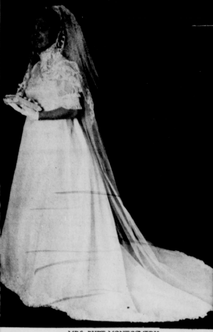
MRS. BURT MONTGOMERY (Shelley Eilene Siebert)

Complete Irrigation Service -All types Sprinkler Systems - Pricess in Inventory 1019 Lubbock Road 637-3535 ownfield, Texas