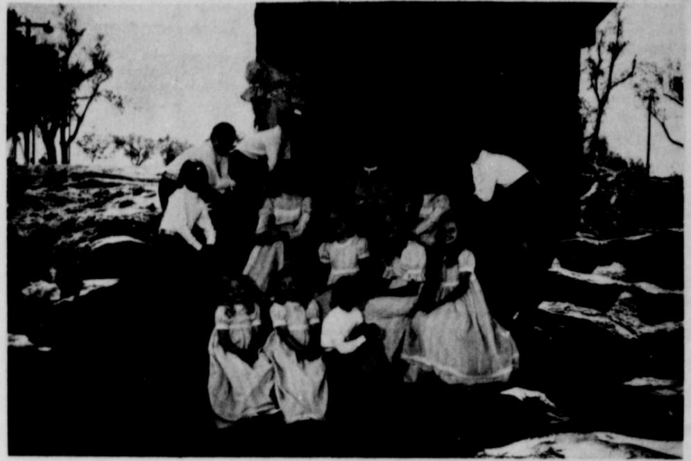
SINGING DISCIPLES MAKE RECORD ALBUM

Following a brief wedding trip the couple will be at home at the Richardson address.