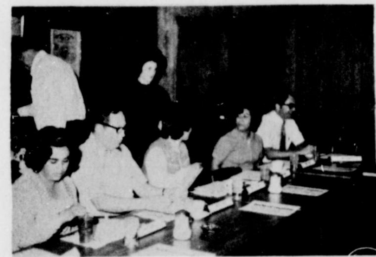
Advisory Committee Members in Action -- Emergency School Aid Act