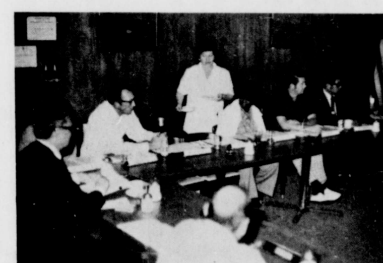
Advisory Committee Members in Action -- Emergency School Aid Act