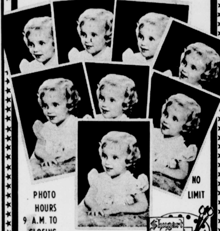
PHOTO HOURS 9 A.M. TO CLOSING NO LIMIT

GET PICTURES MADE OF GRANDPA, GRANDMA, DAD, MOM AND ALL THE LITTLE ONES AT THESE SAME LOW PRICES! SHUGART COLOR PHOTOS PINSON PHARMACY Dial 298-2222 323 MAIN ABERNATHY