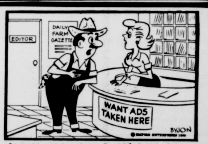
" FARMER, AGE 42 , WISHES TO MEET WOMAN OF 30

A call to Consumers will bring our on-the-farm tirerepair unit to keep your harvest machinery working. Also, call us for motor fuel oil and grease. Our service trucks are radio-dispatched to give you prompt service.