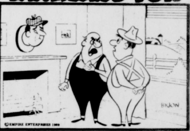
"DAMNED FOLK HUNTER...MISTOOK MY PRIZE COW FOR A MOOSE"

Don't be mistaken about the quality of our merchandise. We prove that GOOD Quality petroleum products and automotive supplies CAN be sold at a lower-than-average price. Try us. Let us prove this statement to YOU.