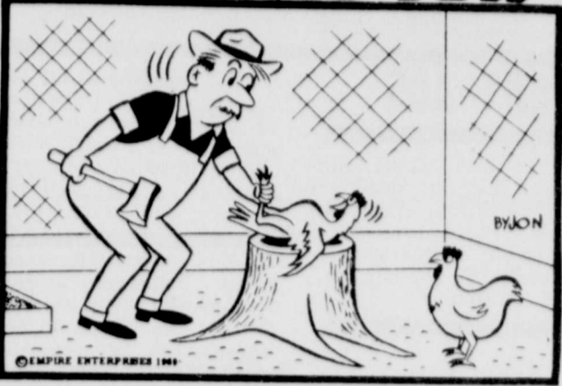
"I HOPE YOU GET A BONE CAUGHT IN YOUR THROAT!"

We Give Fast Service so YOU will not have a slow-down in your harvest activities. CALL US. Our radio-dispatched service trucks will be on the way to fix tires, or deliver motor fuel, Oil and Grease. TIRES - BATTERIES - IGNITION PARTS