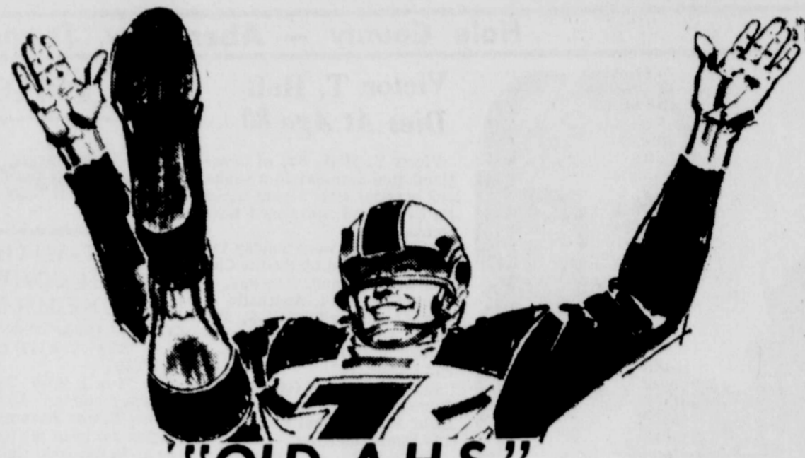
"OLD A.H.S." (School Song)