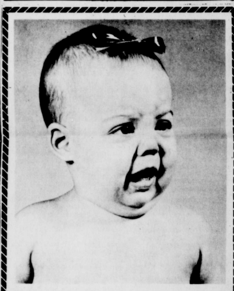
"Don't call me fat! . . . I'm just expanding!"

715 Columbia Street Phone 296-6220 Plainview , Texas