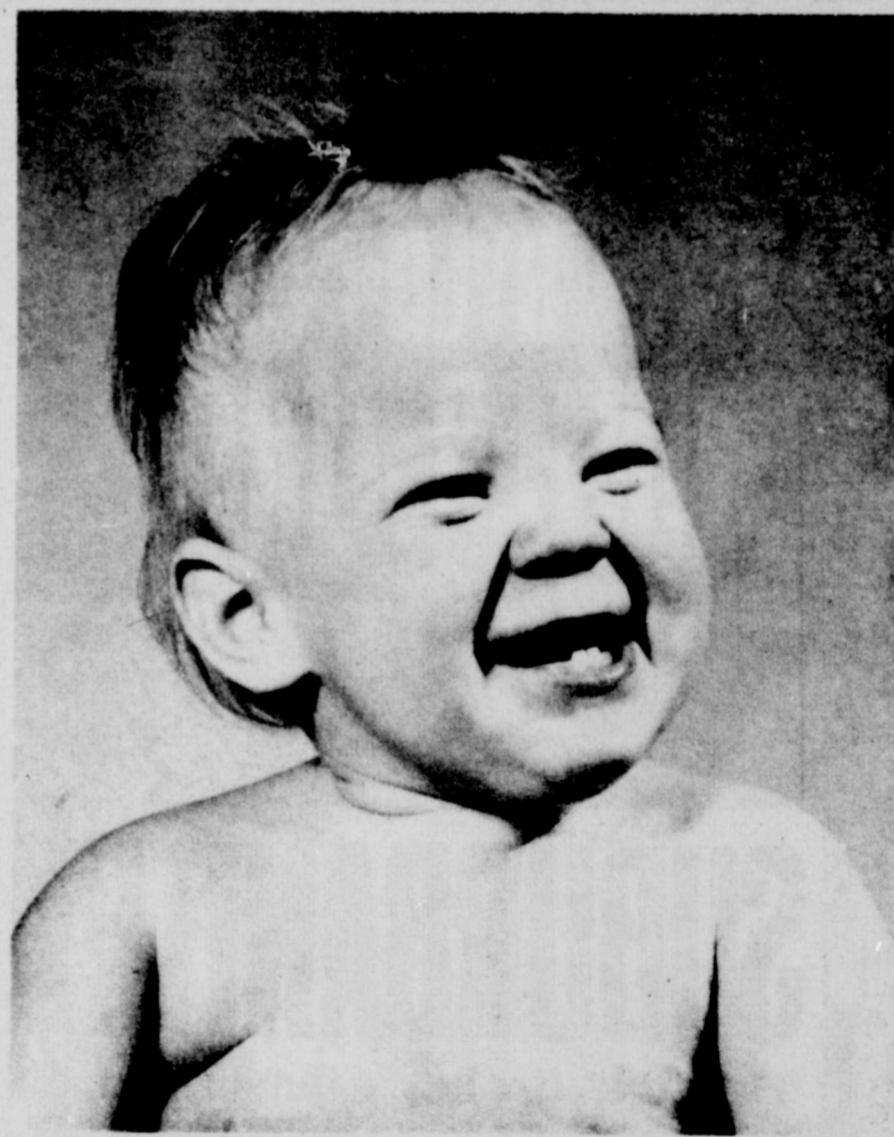
"Can I get a livestock loan on my doggie?"

715 Columbia Street Phone 296-6220 Plainview, Texas