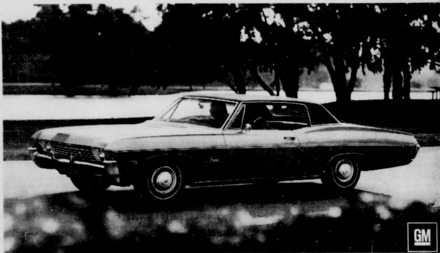
Impala Custom Coupe

NO. 6 FOR The constitutional amendment allowing non-elective state officers and employees to serve in other non-elective offices or positions under this state or the United States until September 1, 1969, and thereafter only if authorized by the Legislature, if the offices or positions are of benefit to Texas or are required by state or federal law, and there is no conflict of interest with the original office or position; prohibiting elected officers under this state or the United States from holding any other office or position under this state; and adding members of the Air National Guard, Air National Guard Reserve, Air Force Reserve, and retired members of the Air Force to the list of persons exempted. AGAINST