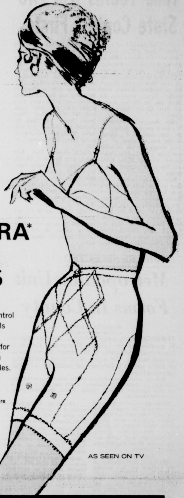
AS SEEN ON TV

The singers, The Breckenridge (Tex.) Boys Choir, are now on tour to the West Coast.