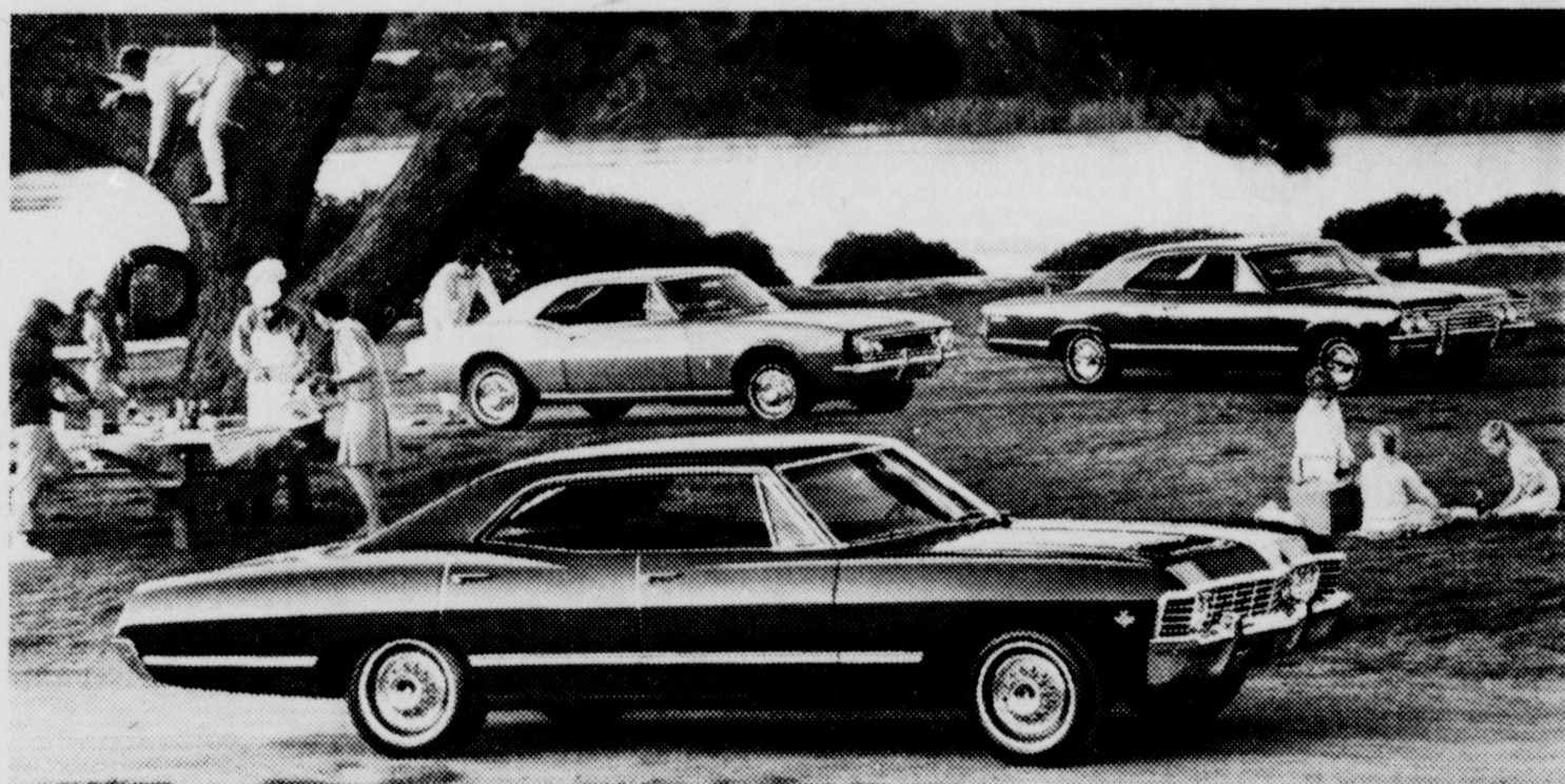
Foreground, Impala Sport Sedan, Background, Camaro Sport Coupe and the Chevelle Malibu Sport Coupe.