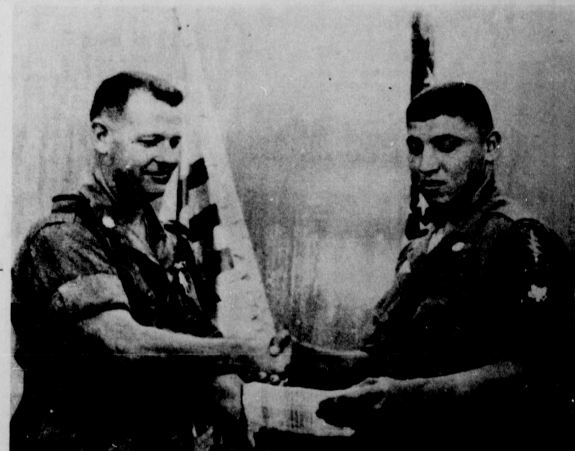
ABERNATHY SOLDIER RECEIVES PROMOTION IN VIETNAM