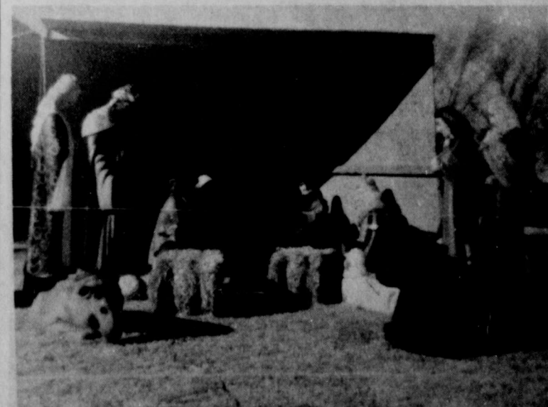
THREE FIGURES are missing from the Nativity scene displayed on the city square during Christmas season. Chamber of Commerce men discovered the loss last week when they were storing the figures. Missing is the Negro Wise Man, second from left in the photo

7. Keep yourself under control. How can you control a helpless against the forces of nature, if you cannot control yourself. You need all your capacities to think fast and act accordingly.