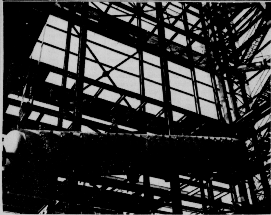
ON THE GROW---Continued construction on a 210,000 kilowatt generator at Nichols Station, northeast of Amarillo, is part of Southwestern Public Service Company's $20,000,000 improvement program for 1967. Pictured is the installation of a 225,000 pound boiler drum for the new generating unit.

Office Phone 298-2600 Residence 298-2601