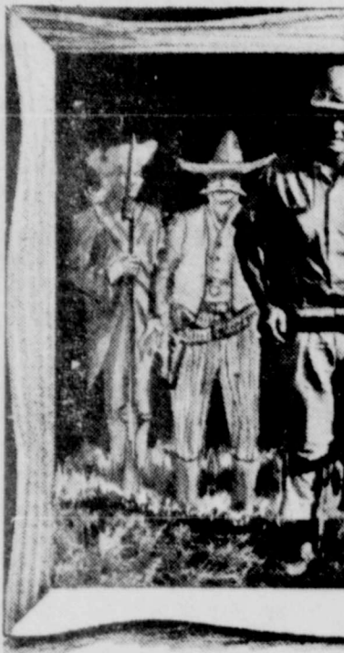
PORTRAIT of a PIONEER

Every generation of Americans from Plymouth Rock to the Klondike, has played a part in the nation's progress. But long before the final chapter is written, the rural electric pioneer has earned an imposing place in the history of rural progress. The member-owned Lighthouse Electric Cooperative, by electrifying remote rural areas, has opened a new frontier for agriculture, for industry, for rural development and for rural people. There is a dramatic story of cooperative achievement that blazed a new trail and is Helping Texas Grow.