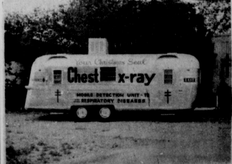
MOBILE X-RAY UNIT