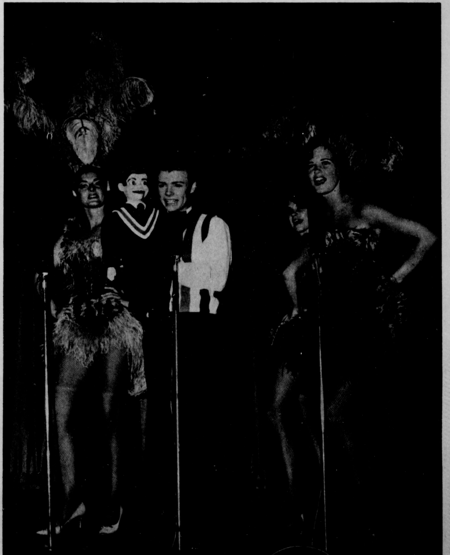
"L" IS FOR THE WAY YOU LOOK--AT ME!--Jay J. Jay, the idea-minded dummy, gets a few pointers from three lovely showgirls from Gilchrist U. in a musical number. He is "hired" to find a cause for the mythical school in the production now in its third week of a summer-long run