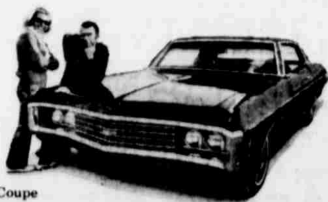
Impala Custom Coupe