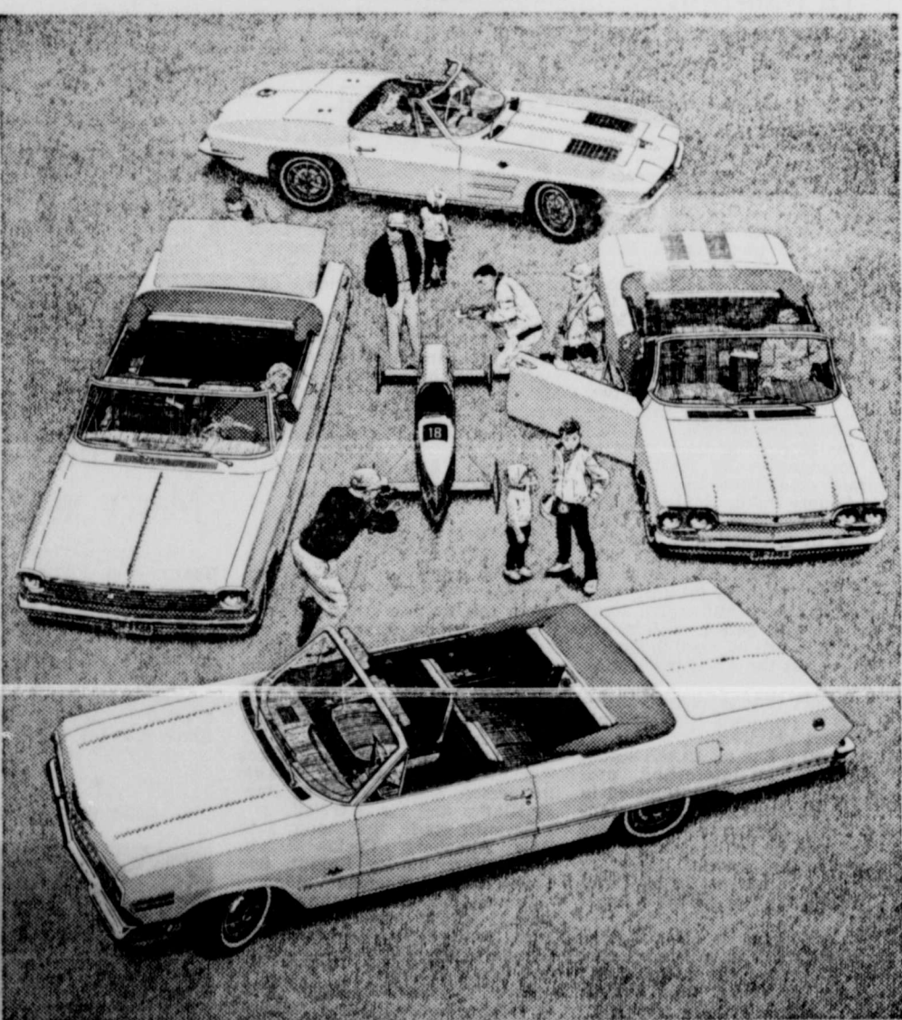
Models shown clockwise: Corvair Monza Spyder, Chevrolet Impala Super Sport, Chevy II Nova Super Sport, Soop Boz Derby Racer, built by All-American boys.

NOW SEE WHAT'S NEW AT YOUR CHEVROLET DEALER'S