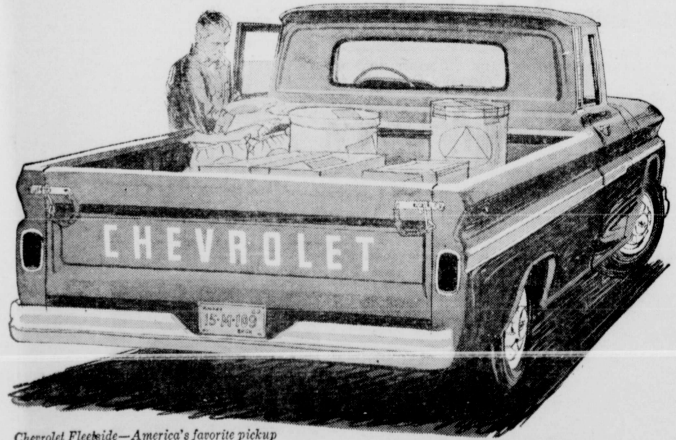
Chevrolet Fleetside—America's favorite pickup

Sound engines, strong frames, double-wall construction, insulated cabs, separated bodies and cabs, tight tailgates . . . are some of the features that help Chevrolet trucks work longer and bring back more of your investment at trade-in. If you wish you had a truck that cost you less thought and attention, put your money on quality. Make your next buy a dependable Chevrolet truck.