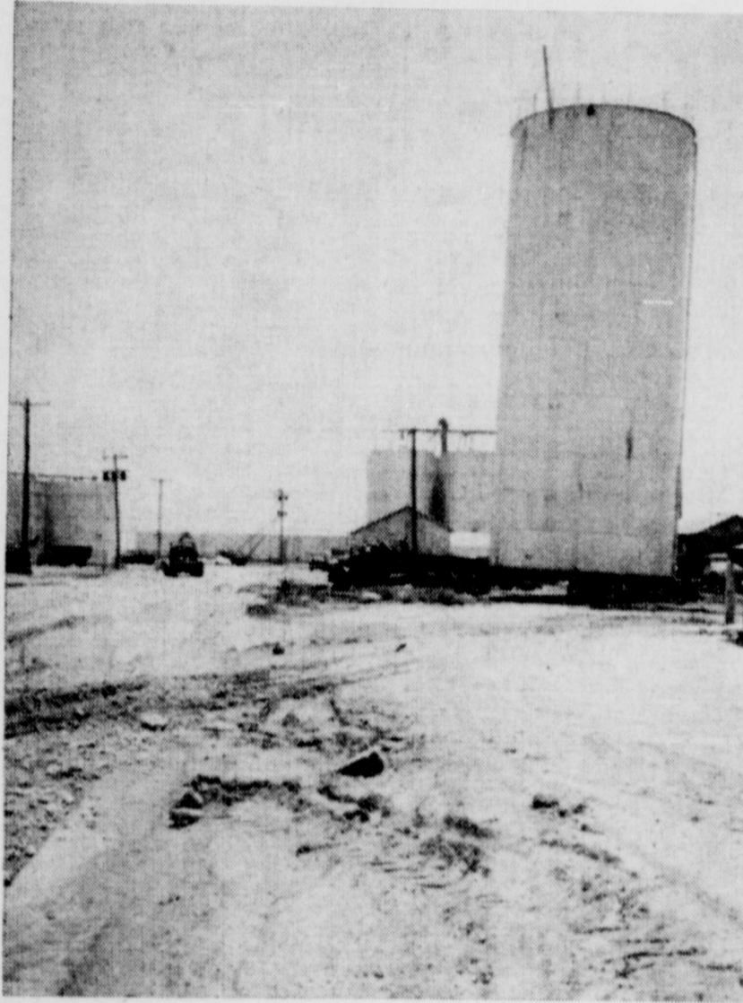
TANK MOVED—This picture was made last week while movers were taking the water storage tank off the railroad right-of-way and relocating it about a quarter of a mile south on the Plains Grain Co. property.