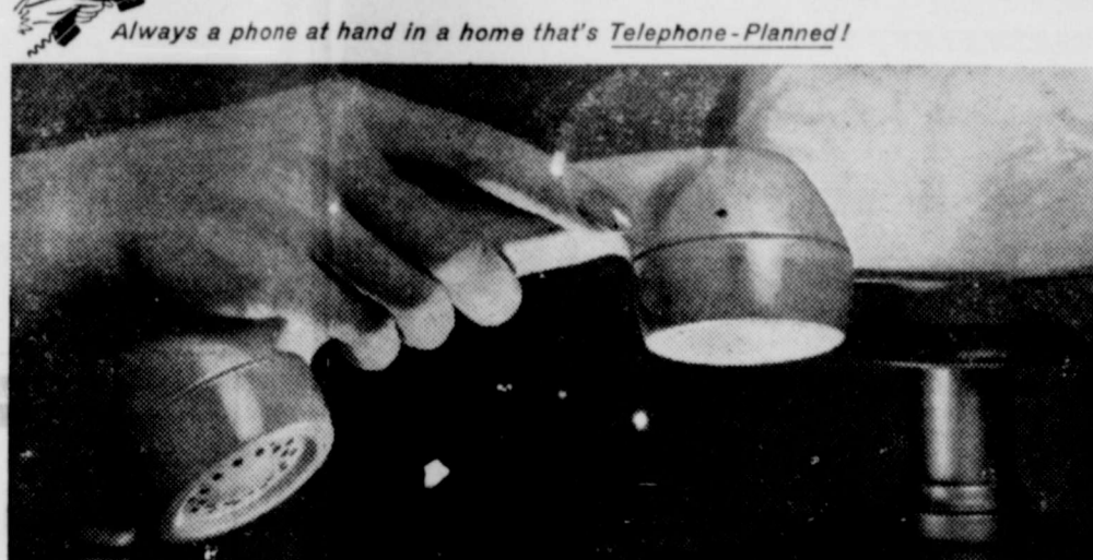
Automatically lights at night

All Meat BOLOGNA . . . . . lb. 39c | Kimbell DOG FOOD . . 2- 15c