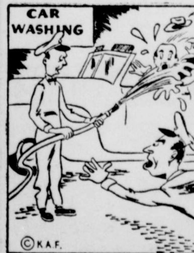
"Let 'em get out before we start giving service."

We do let you out before washing. Try Us.