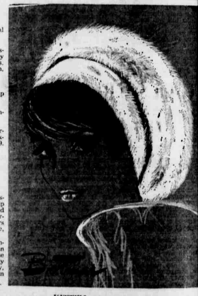
KITTEN. BETMAR'S Angora Beret drape it to suit your mood. Only $6.00 Lane-Felker