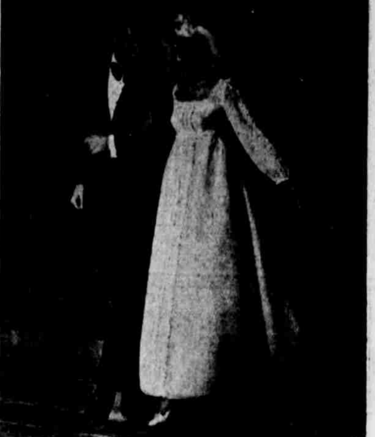
In the romantic tradition—a fragile shirtdress for the summer bride. An organza empire gown traced with Val lace on the squared-off bodice, softly dirndled skirt and 3/4 sleeve—the chapel-length train is attached. By Miss Betsy.