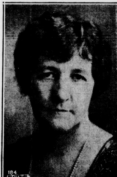
MIRIAM A. FERGUSON