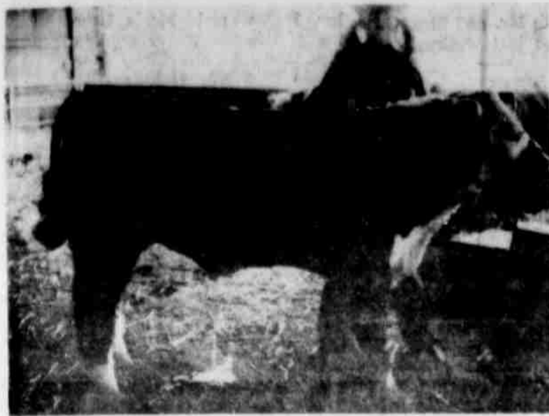
FIRST LIGHTWEIGHT STEER; FIRST LIGHT HEAVY-WEIGHT STEER—Rita Hager