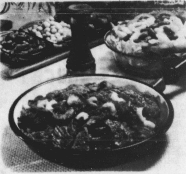
Try Braised Short Ribs, a medley of beef, vegetables, and rice for a flavorful meal-in-one dish served from the oven.

Brown ribs, 25 to 30 minutes, on all sides in skillet. Season with salt. Place in 3-quart casserole. Cover; bake at 325° for 1 hour. Using same skillet, combine rice and vegetables; cook till rice is lightly browned. Remove ribs from oven after baking for 1 hour; drain. Remove ribs from casserole. Place rice mixture in casserole; top with ribs. Combine remaining ingredients, 2 1/4 cups water, 2 teaspoons salt, and 1/8 teaspoon pepper in saucepan; bring to boil. Pour over ribs. Cover; bake 1 hour more. Serves 4 to 6.