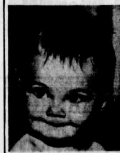
"What A Nice Insurance Man!"

She wanted to know if the Hartsfield Agency had insurance to cover her wedding gifts in case of loss, theft, or accidental damage. We were pleased to accommodate her with a Wedding Gifts floater policy.