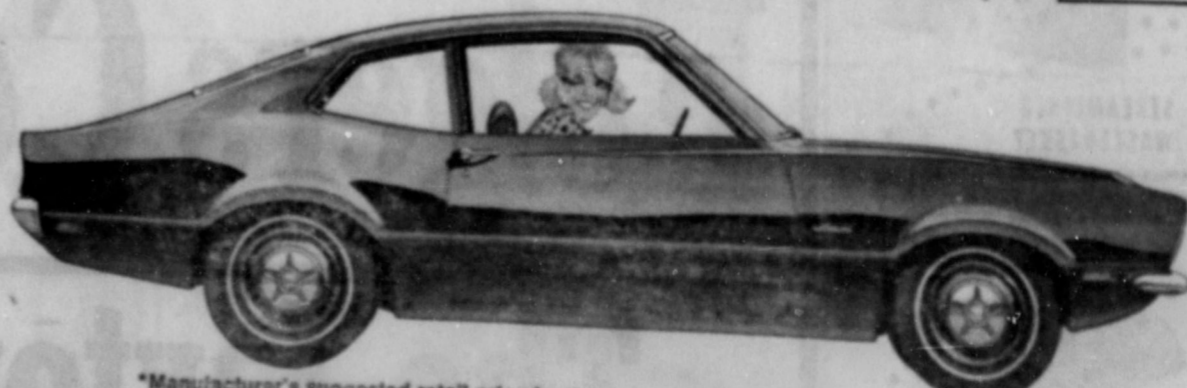
*Manufacturer's suggested retail price for the car. Price does not include: white sidewall tires, $32.00; dealer preparation charge, if any; transportation charges, state and local taxes.

For an authentic 1/25 scale model of the new Ford Maverick, send $1.00 to Maverick, P.O. Box 5397, Department , Detroit, Michigan 48211. (Offer ends July 31, 1969.)