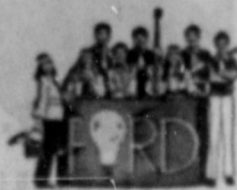
IT'S THE GOING THING!