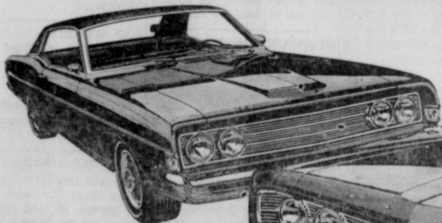
Fairlane 2-Door Hardtop

Ford's little Maverick is coming on April 17. Import buyers! Wait! Everybody else can start saving now at Ford's Countdown Sale.