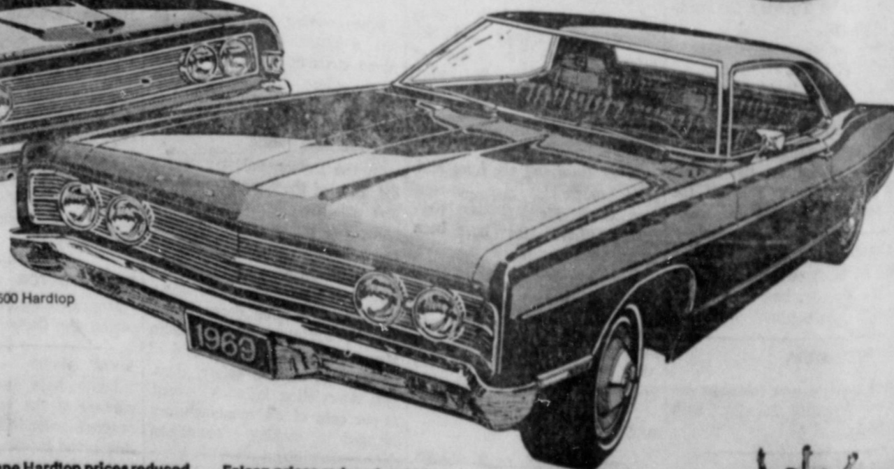
Ford Galaxie 500 Hardtop

Ford Galaxie 500 prices reduced up to $144... save on popular options like a 390 V-8, air conditioning, tinted glass. Enjoy extras like vinyl trim, WSW tires, wheel covers, Rim-Blow steering wheel.