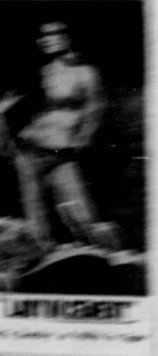
Caption text below the portrait.