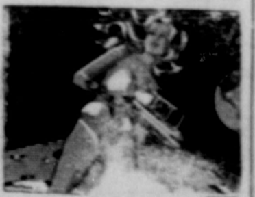
HI HO THEATRE in SPUR