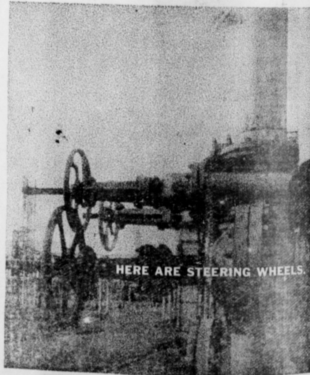
HERE ARE STEERING WHEELS.

WITH THESE WHEELS THE MEN AT SHAMROCK CONTROL THE QUALITY OF SHAMROCK GASOLINE.