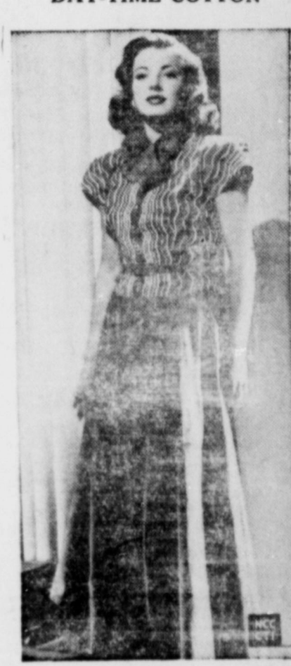
This steel-gray chambray daydress of floor length, worn by Eleanor Parker, beautiful Warner Bros. star, has icy-white wavelengths embroidered to the waist.