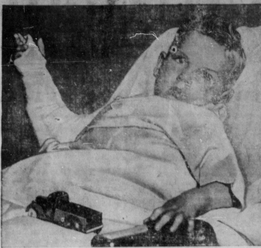
This child was hurt when a tornado struck Tupelo, Mississippi, necessitating medical and nursing care for hundreds—care which in many cases could not have been given without Red Cross assistance. It is a fine tribute to the organization that the young beneficiaries of its health and relief services invariably place themselves in the hands of the Red Cross with a completely confident, "Now I lay me—"

Mexico and the United States concerning the use of waters of the Rio Grande, Mexico can divert what ever amount of water she desires through this intake, seriously jeopardizing irrigation below Donna.