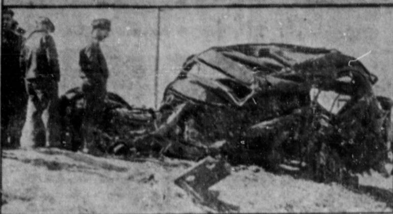
Hays, Kans.—A statewide movement to enact legislation which will seek to curb the serious increase in the destruction of life and property is spurred on daily by such sordid scenes of truck and motor car disasters as shown above. In this head-on collision ten miles west of Hays the occupant of the

good thing inspectors don't come every week to make us take those "crazy" things for them. There probably wouldn't be anything left of these '37 Seniors. We all make 0 on such tests up here. (part of the time.)