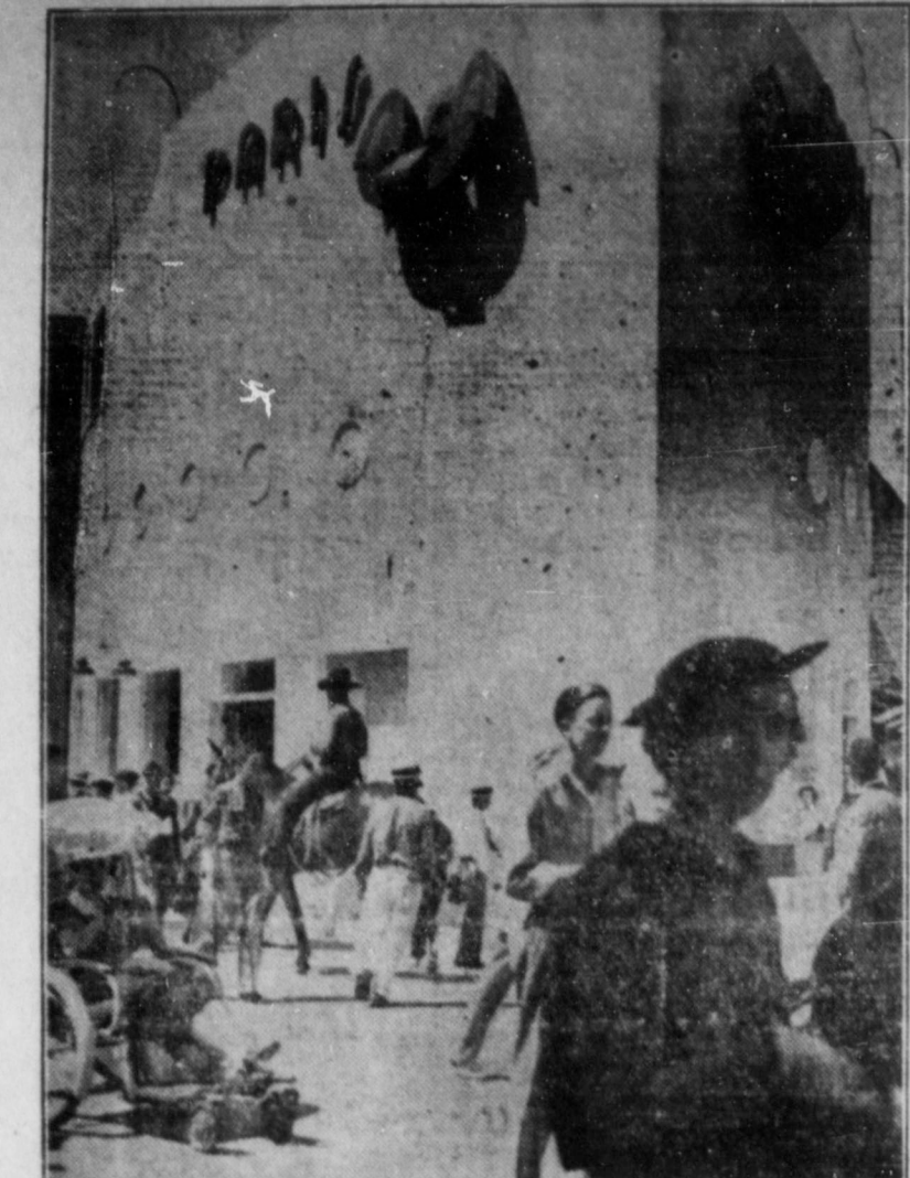
BOAT CENTER OF FAIR FUN SPOT .- An exact reproduction of the out lines of the liner Normandie forms the front center of "The Streets of Paris," gay fun spot of the $25,000,000 Texas Centennial Exposition which will run in Dallas until November 29. Flanking the ship is a French Village forming an open-air court of concessions