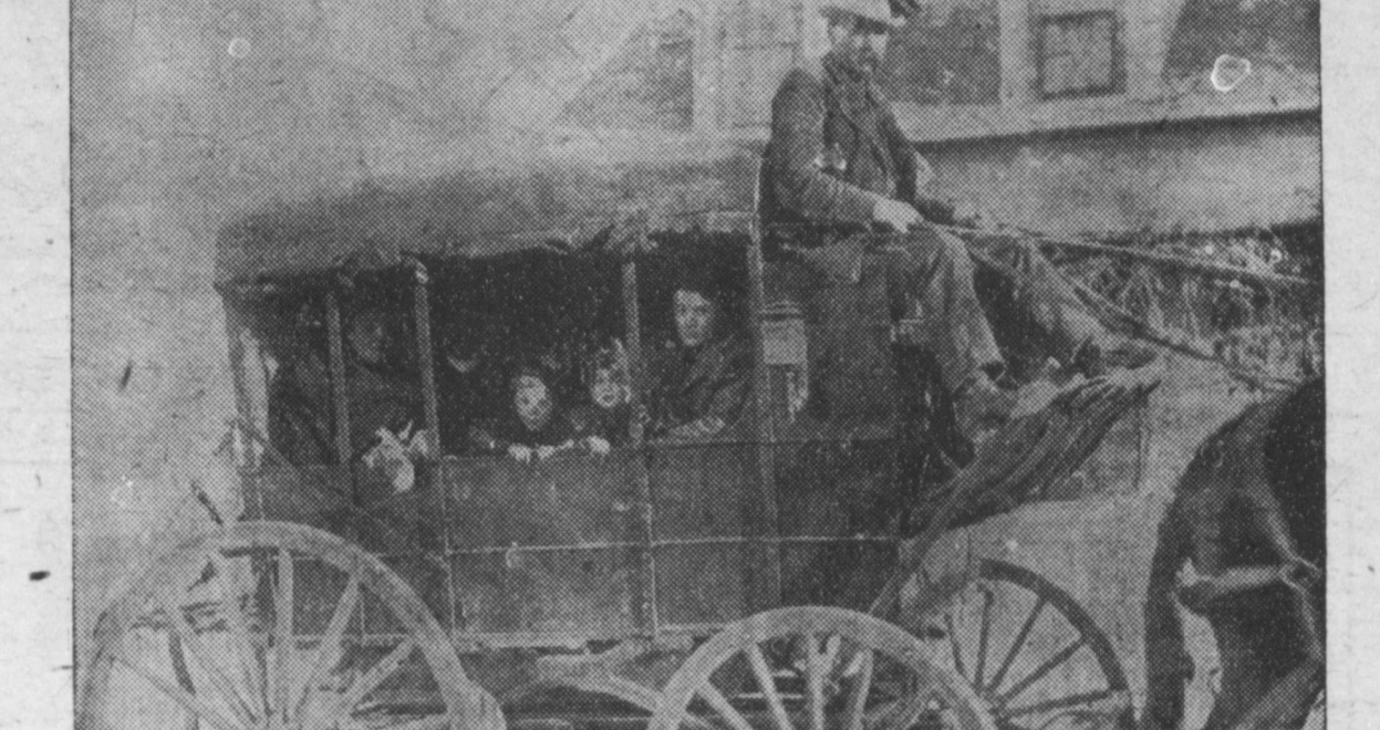
BEFORE ARIZONA WAS A STATE-In 1898, when Fort Huachuca was emerging from its Indian fighting days but its electronic proving ground days were a good half century away, the chaplain's family first saw its new home from this primitive mule-drawn stagecoach. Driver and chaplain vie for walrus mustache honors. Huachuca, now 75 years old, was once the home of the Apache Scouts.