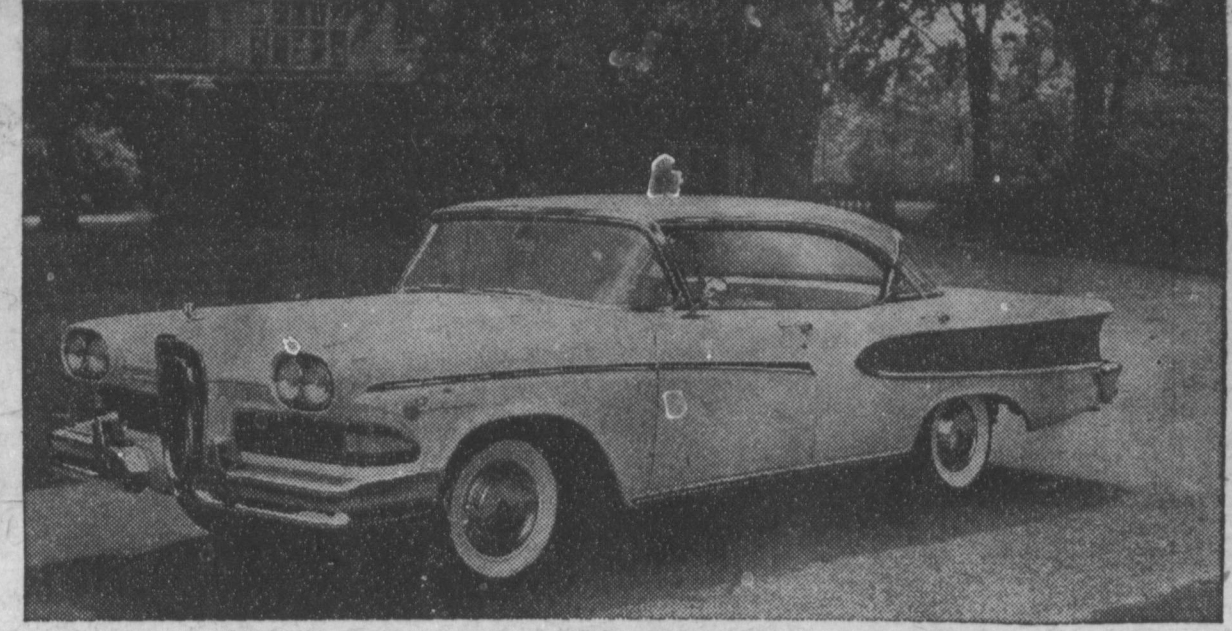
THIS IS THE EDSEL, Ford Motor Company's newest entry in the medium price car field, available in 18 models in four series-Ranger, Pacer, Corsair and Citation. The entire line will go on display in all Edsel dealerships Sept. 4th. Shown is the Pacer four-door hardtop. From its vertical grille, dual headlights and wraparound turn indicators through the single chrome side spear and concave sculptured "teardrop" side scallop, the Edsel gives an impression of motion even when parked. In addition to its dramatic styling, the Edsel offers a wide range of exclusive engineering features including "Teletouch" push button automatic transmission controls located in the steer-