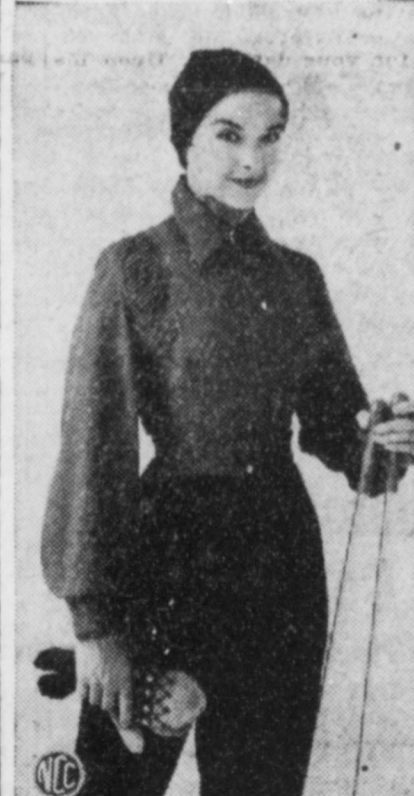
This pretty sportswoman is warmly clad to spend her winter holiday on skis. For her outing in the snow, she wears a smart ski jacket of Reeves cotton poplin. The cotton fabric is ideal for the cold weather outfit, for it protects her from the wind and snow.